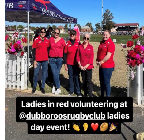
Ladies in red volunteering at @dubbooroosrugbyclub ladies day event! 🍌🍌🍌🍌🍌