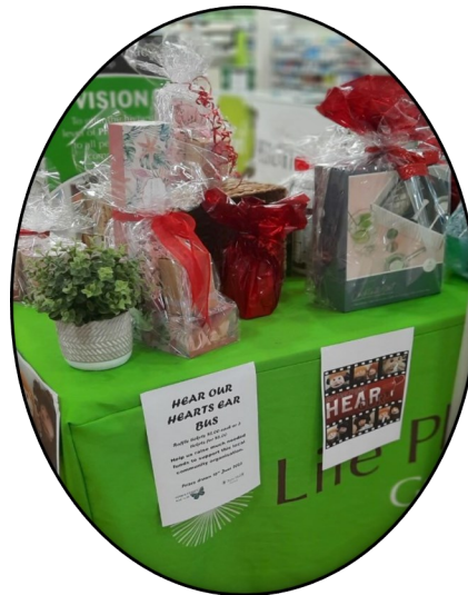
Part of the raffle